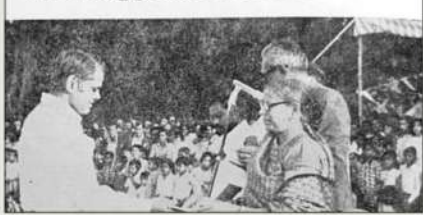
■ Our Correspondent KORBA, Nov 3