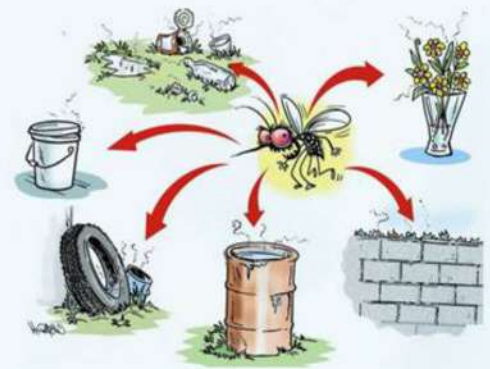
Precautions to Prevent Dengue