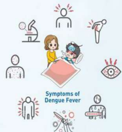
Symptoms of Dengue Fever