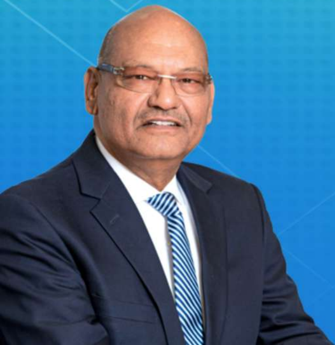
Anil Agarwal Chairman, Vedanta Limited