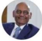
Anil Agarwal ✓ @AnilAgarwal_Ved