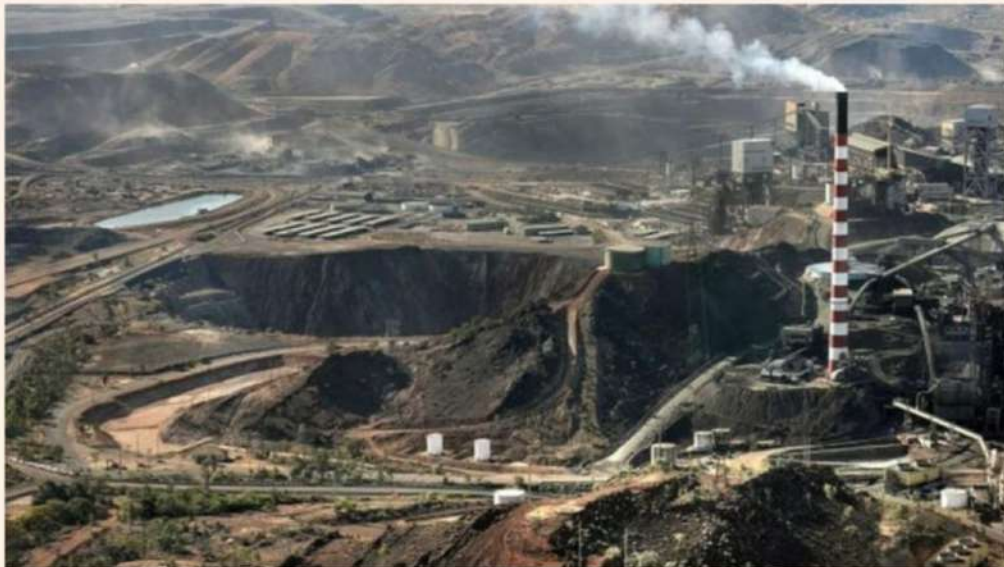
The Mount Isa mining complex in Queensland: Australia and other countries are seeking to secure supplies of critical minerals

Albanese government considers price floors to develop supply chain