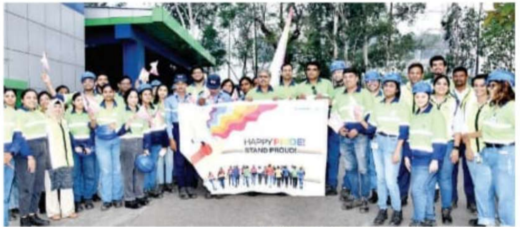
A series of activities were organized within its operations by BALCO.

BALCONAGAR: Balconagar Bharat Aluminium Company Limited (BALCO), India's iconic aluminium producer and a part of Vedanta Aluminium, organized a series of activities within its operations and the surrounding community to raise awareness during International Pride Month. The month-long activities drew wide participation from over 250 employees, business partners and community members, uniting to foster an inclusive environment for the LGBTQ+ community.