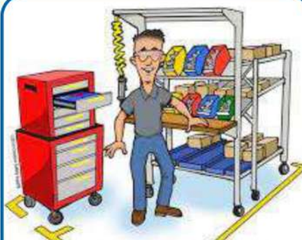
After implementing 5S