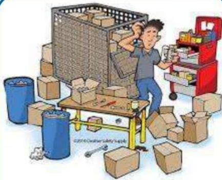
Before implementing 5S