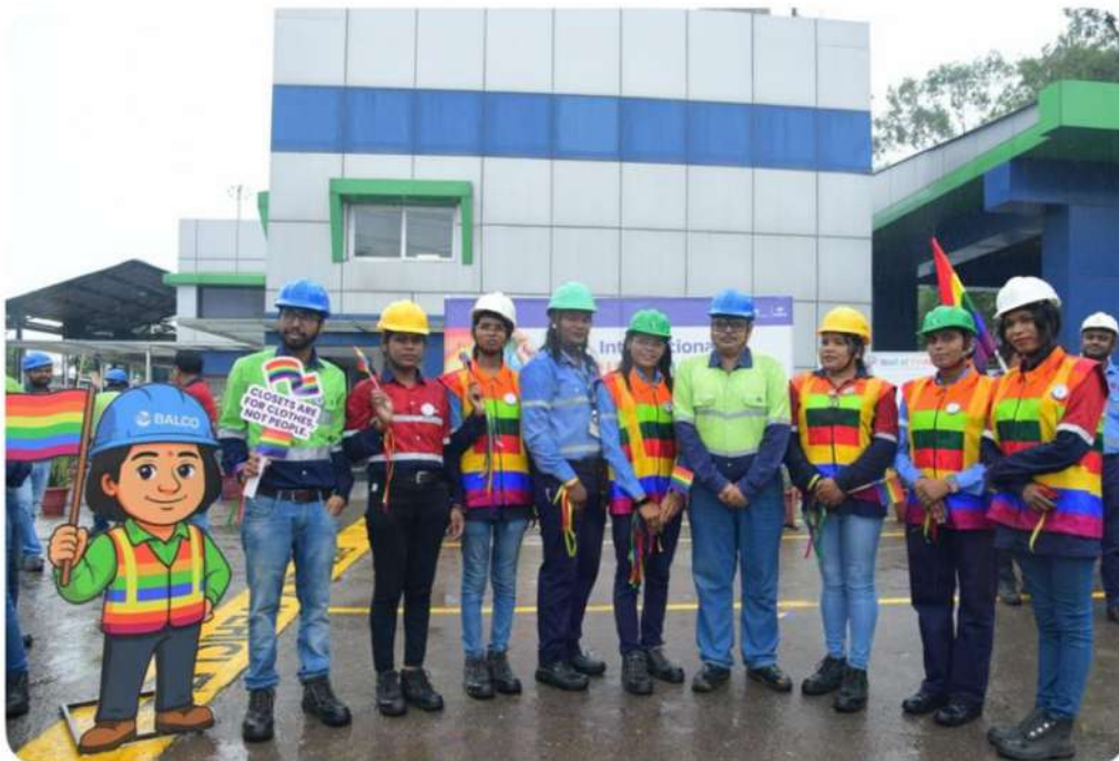
Vedanta Group and Balco India